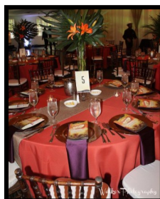
TABLE OF 10 — $1,000

REGISTRATION - Welcome guests to the event and sponsor the area where guests will register and check out. $2,000