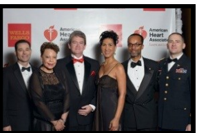
PHOTO AREA SPONSOR - Sponsors the step and repeat logo photo backdrop or photo booth. $3,000

FUND-A-NEED SPONSOR — Sponsor the giving moment and paddles during the event. $3,000